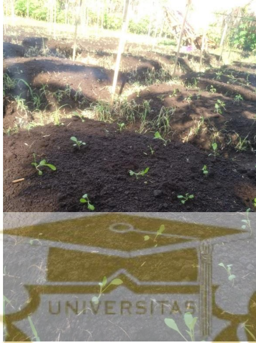
Pengukuran Tinggi Tanaman dan Panjang Daun